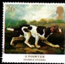
26 A POINTER GEORGE STUBBS