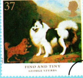
37 FINO AND TINY GEORGE STUBBS