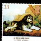
33 A ROUGH DOG GEORGE STUBBS