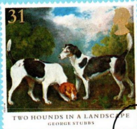
31 TWO HOUNDS IN A LANDSCAPE GEORGE STUBBS