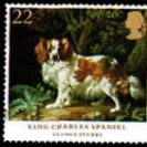
22 KING CHARLES SPANIEL GEORGE STUBBS