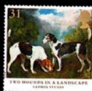
31 TWO HOUNDS IN A LANDSCAPE GEORGE STUBBS