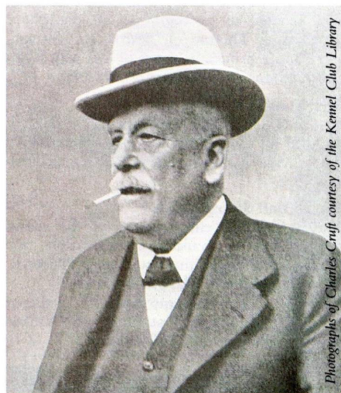
Photographs of Charles Cruft

The best-known dog show remains Cruft's, the brainchild of Charles Cruft (1852-1938). He was invited to organise the canine section of the Paris Exhibition in 1878 and in 1885 the Allied Terrier Club Show in London. In 1891 he organised, at the Royal Agricultural Hall in Islington, his own dog show which celebrates its centenary in 1991. Since 1948 the show has been under the jurisdiction of the Kennel Club; it was held at Olympia from 1948 to 1978, at Earl's Court from 1979 to 1990 and in 1991 will, for