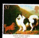
37 FINO AND TINY GEORGE STUBBS